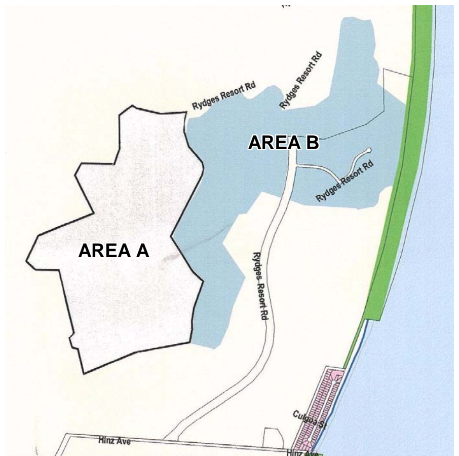
AREAS A & B