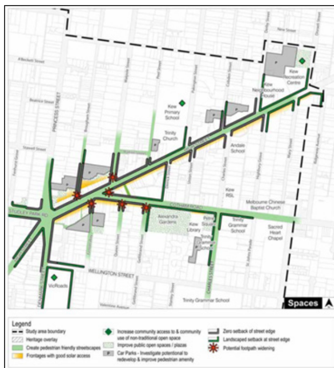
Figure 3: Example structure plan - built form and civic spaces

Reference should be made to the Structure Planning and Urban Design Planning Scheme Policy contained within Schedule 7 of the planning scheme. This provides guidance on the outcomes expected from structure plans, urban design principles and the process required to prepare structure plans.