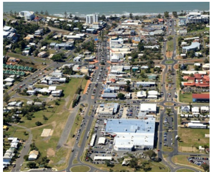
Figure 6: Major Centre at Yeppoon