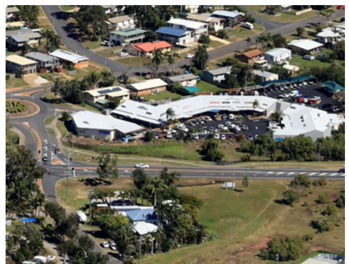
Figure 2: Neighbourhood centre of Taranganba (Cedar Park Shopping Centre)