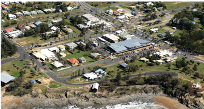
Figure 4: Local centre of Emu Park