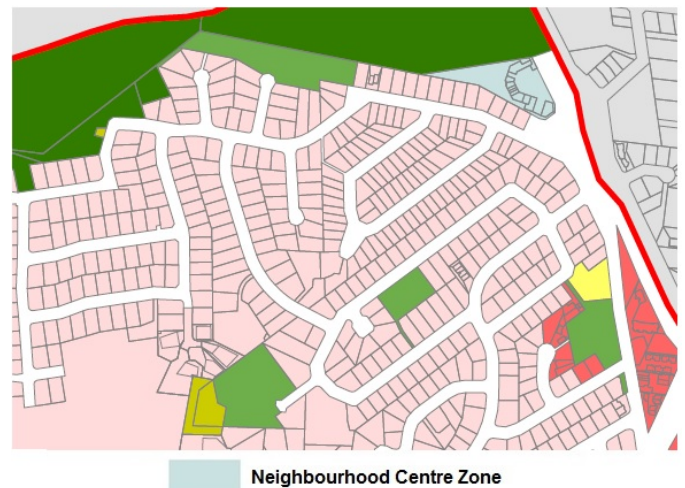
Figure 1: Example Map - Neighbourhood Centre zone

This zone will provide for the development of small scale neighbourhood centres which serve the convenience (day to day) needs of a neighbourhood. Urban form in this zone is characterised by low rise buildings, high site cover, and appealing streetscapes and public places.