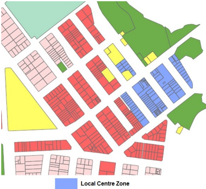
Figure 3: Example map - Local Centre zone

This zone provides for the development of centres which are a scale that services a local trade catchment. Urban form in the zone is characterised by low rise buildings, high site cover, and appealing streetscapes and public places.