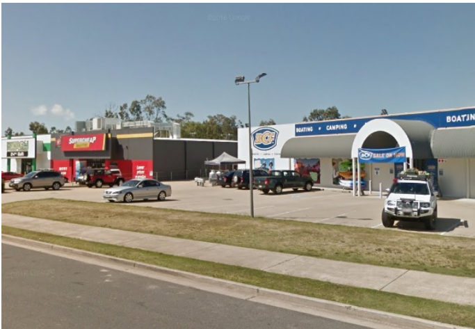
Figure 8: Example of Large Retail Showrooms