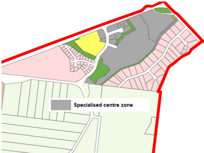
Figure 7: Example map - Specialised centre zone

In addition to the Centre category zones, the Livingstone Planning Scheme 2018 has a zone called the Specialised Centre zone. This zone has a substantially different role and function compared to Centre category zones. The Specialised Centre zone provides for the development of large bulky goods retail showrooms and other retailers attracted to having large floor areas.