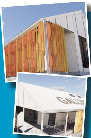
Fig Tree Galleries

Current expansion works of the Fig Tree Galleries (formerly the Mill Gallery) are progressing well, as construction begins on the new gallery building. In association with the recent refurbishments to the Old Post Office building, the completion of the new gallery will create vibrant new spaces for artists and visitors to enjoy.