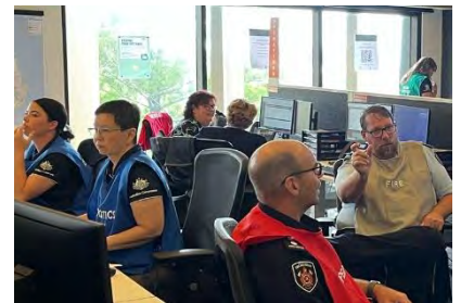
The LDCC was a hive of activity

It was a great opportunity to test and refine skills and to introduce some new recruits to the LDCC.