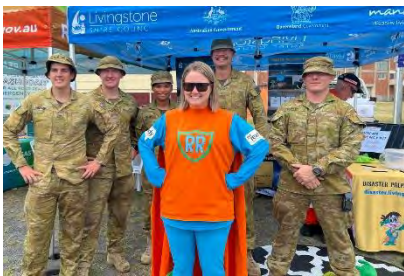
Resilient Ricky sharing superpowers with the ADF personnel

Rocky Ready , was held on Sunday 16 October. The Australian Defence Force held a Demonstration Day at Rockhampton Showgrounds. This activity concluded a busy few days that included a planned combined exercise with Queensland Fire and Emergency Services (QFES) and Livingstone Shire Council that simulated a combined response to a disaster event.