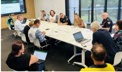
The LDMG conducting their meeting and receiving agency updates