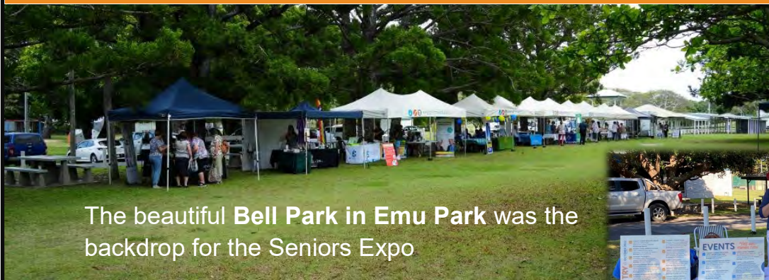
The beautiful Bell Park in Emu Park was the backdrop for the Seniors Expo