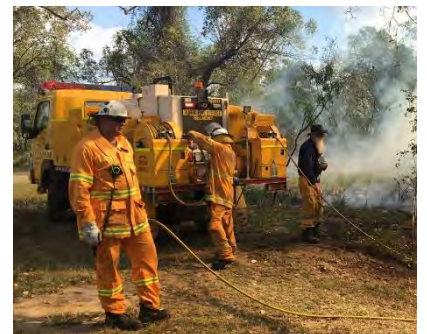
Belmont Rural Fire Brigade hard at work

Livingstone Shire Council Hazard Reduction Burns Council continues to liaise with Queensland Fire and Emergency Services to implement their 2022 burn program. This month burns were conducted at Emu Park and Glenlee estate. Thank you to the crews that made these activities possible and the neighbouring community for your understanding during these times.