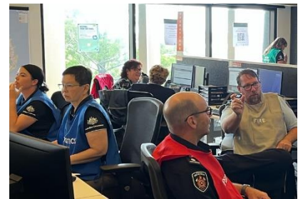
The LDCC was a hive of activity

It was a great opportunity to test and refine skills and to introduce some new recruits to the LDCC.