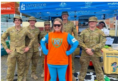
Resilient Ricky sharing superpowers with the ADF personnel

Rocky Ready , was held on Sunday 16 October. The Australian Defence Force held a Demonstration Day at Rockhampton Showgrounds. This activity concluded a busy few days that included a planned combined exercise with Queensland Fire and Emergency Services (QFES) and Livingstone Shire Council that simulated a combined response to a disaster event.