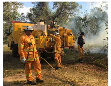
Belmont Rural Fire Brigade hard at work

Livingstone Shire Council Hazard Reduction Burns Council continues to liaise with Queensland Fire and Emergency Services to implement their 2022 burn program. This month burns were conducted at Emu Park and Glenlee estate. Thank you to the crews that made these activities possible and the neighbouring community for your understanding during these times.