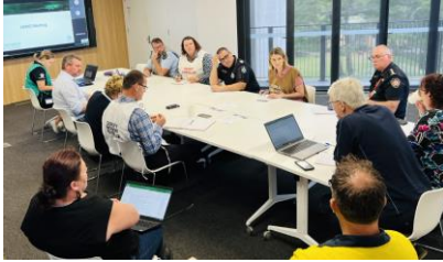
The LDMG conducting their meeting and receiving agency updates