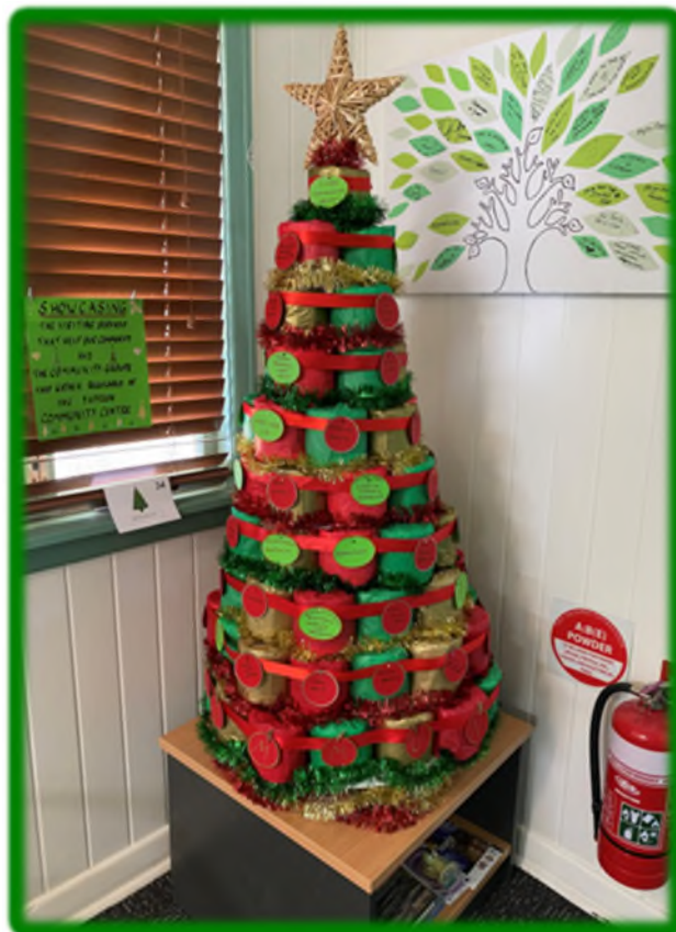
Christmas Tree Festival 2022