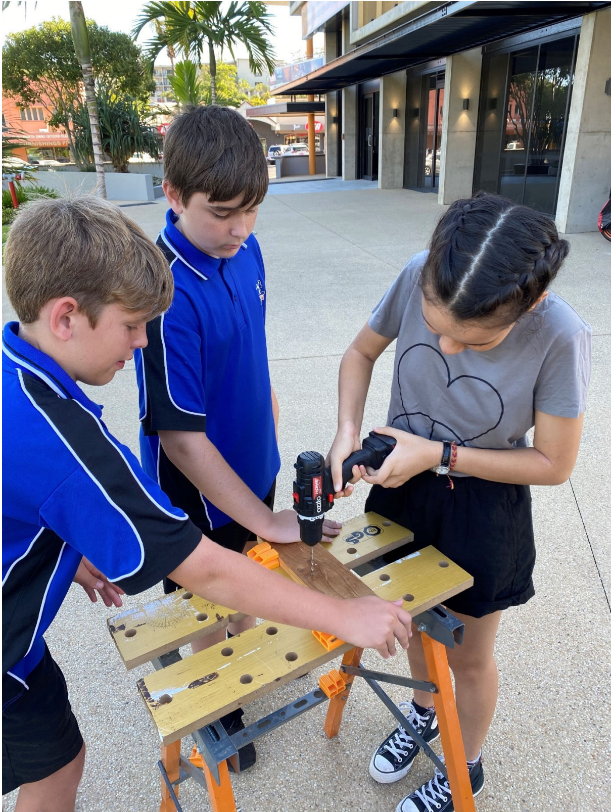
Youth Action Group – Upcycle Project Wrap Up