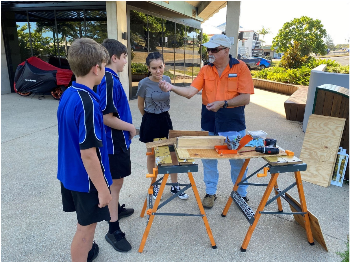
Youth Action Group – Upcycle Project Wrap Up